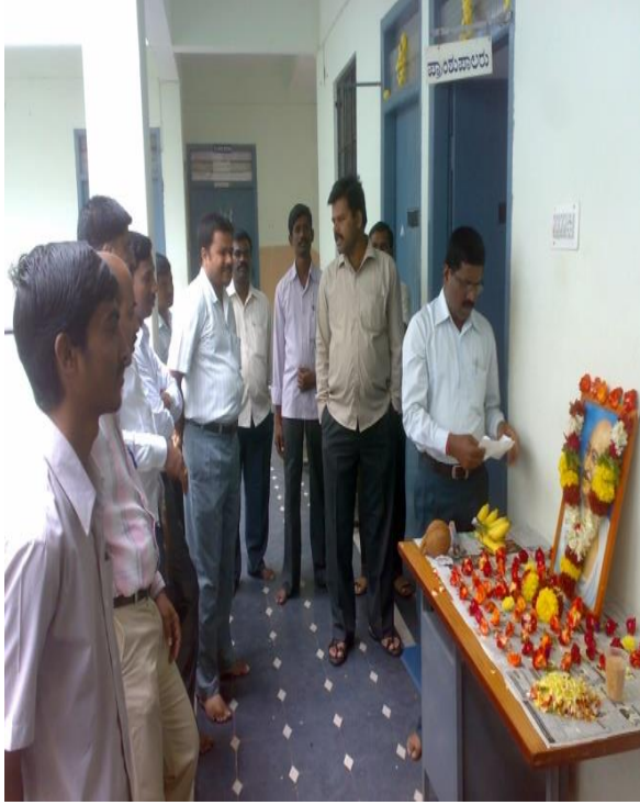
Celebration of Gandhi Jayanti.