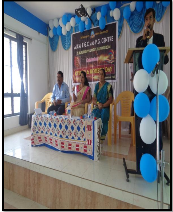
ಎತ್ತಿಕಾ ಡೇ Ethnic Day