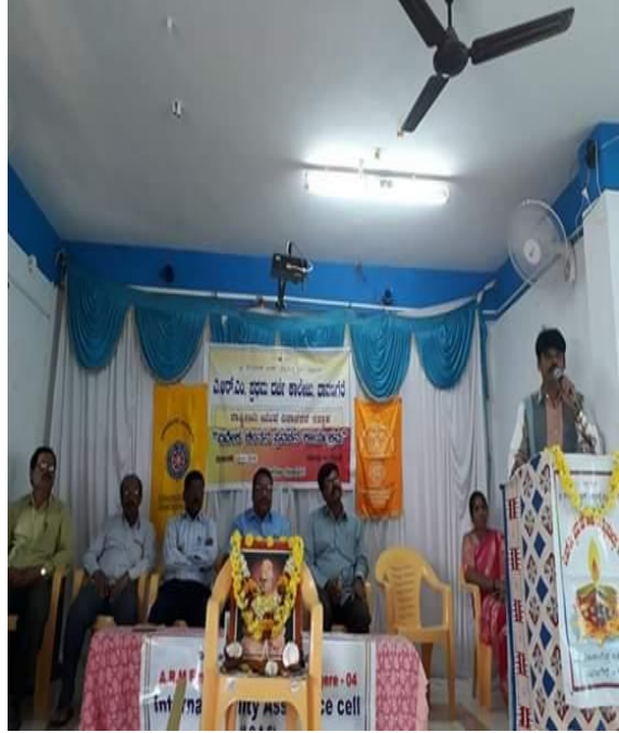
Celebration of Swami Vivekananda Jayanti. ಎತ್ತಿಕಾ ಡೇ Ethnic Day