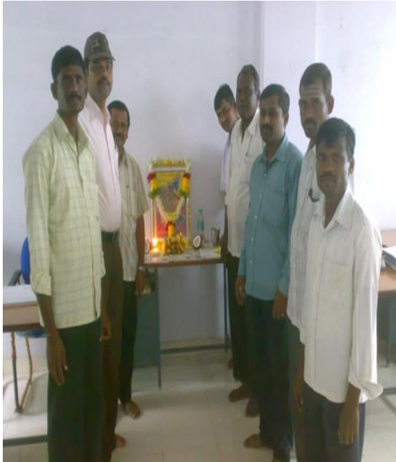
ಕರ್ನಾಟಕ ರಾಜ್ಯೋತ್ಸವ Karnataka Rajyotsava