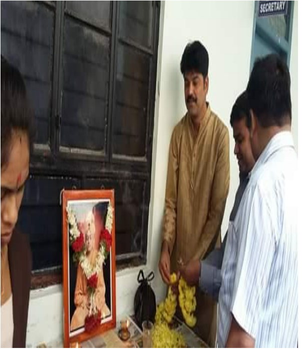
ವಾಲ್ಮೀಕಿ ಜಯಂತಿ Valmiki Jayanti