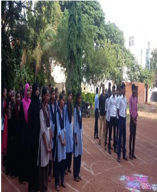
Attended the students