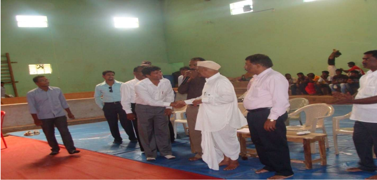
Sharing information about Judo Game to gather students